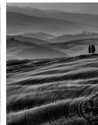
The Wheat Field, Nick Hopwood