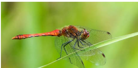
Ruddy Darter