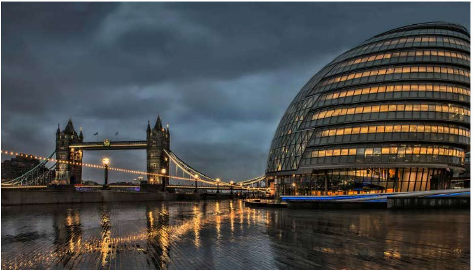
South Bank Reflections by Nick Hopwood

Affiliated to the North & East Midlands Photographic Federation