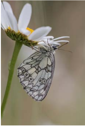
Marbelled white